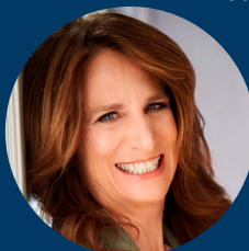
Board Certified ADHD Coach Mental Health Counselor